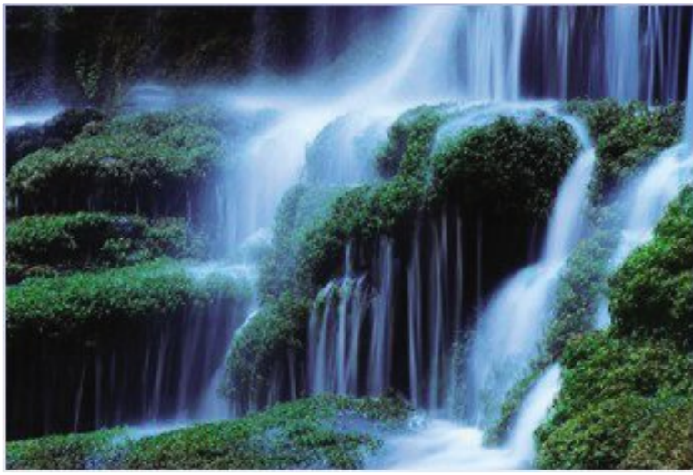
The Refreshing Waters Program®

We recognize that everyone has strengths, gifts, and something valuable to contribute to their community. The Refreshing Waters® Program is built on the understanding that those struggling with dementia-related illness still have a lot to say—we just need to know how to listen.