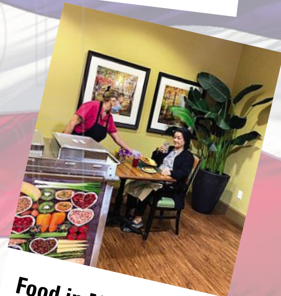
Food in Motion Cart